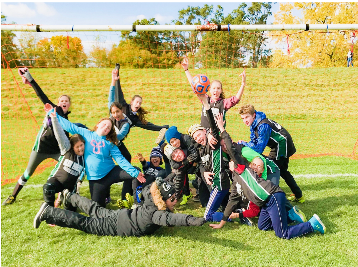
Intermediate Co-ed Soccer Tournament 2018