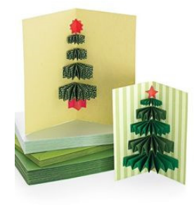
Tree Cards (Halabecki)