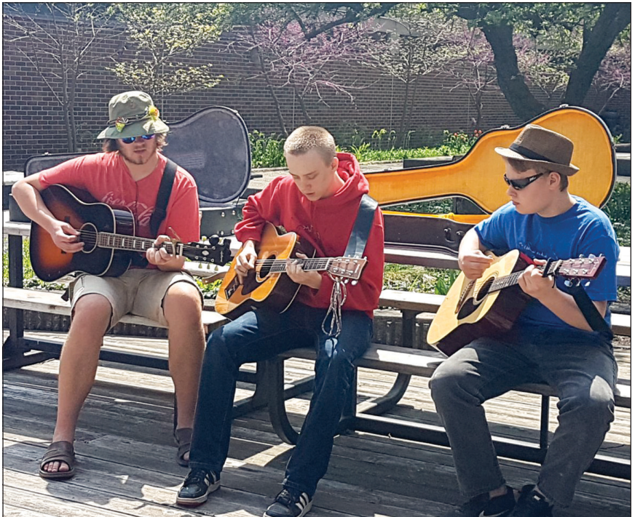
PARIS DISTRICT HIGH SCHOOL

It is important students select Grade 9 courses based on their strengths and interests. Being successful in all Grade 9 courses will give students more pathway choices as they progress through secondary school.