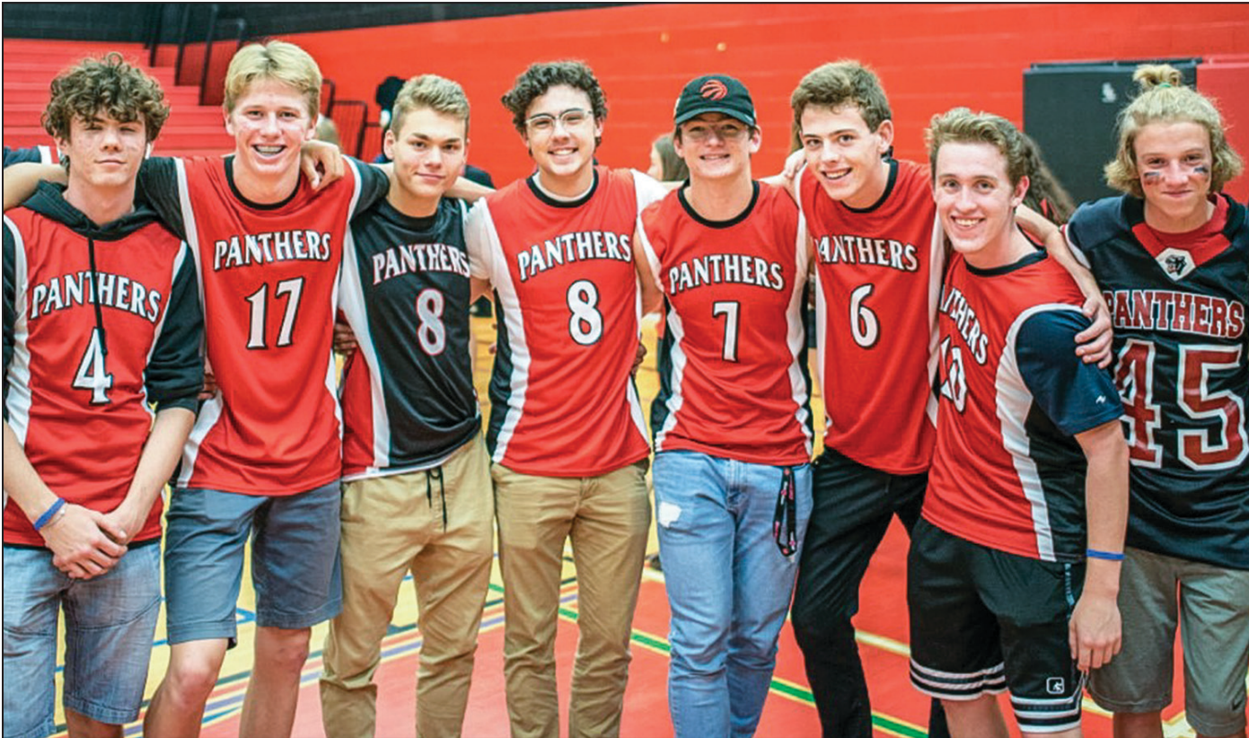
PARIS DISTRICT HIGH SCHOOL