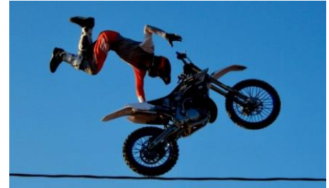
Above: Flying Unicorn by Kara Sickle.

Congratulations to each of these students on these very Impressive achievements!