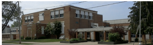
Dunnville Secondary School 110 Helena Street Dunnville, N1A 2S5 Located near Dunnville's downtown core.