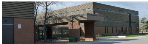
Hagersville Secondary School Box 669, 70 Parkview Road Hagersville, N0A 1H0 Conveniently located across from the West Haldimand General Hospital.