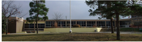
Cayuga Secondary School #70 Haldimand Highway 54 Cayuga, N0A 1E0 Close proximity to County's Administrative building, OPP detachment, Provincial Courts.