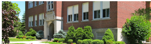
Waterford District High School 227 Main Street South Waterford N0E 1Y0 Close proximity to City of Brantford.

Technical Training Facilities Post Secondary Learning Centres Childcare/Daycare Facility Healthcare Related Services Research Facilities Social Service Offices Community Hubs