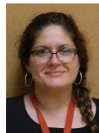
Mme Almeida Kindergarten