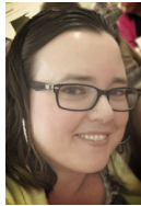
Mme Rudge Kindergarten