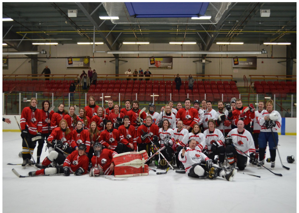
Senior Student Vs. Teacher Annual Christmas Hockey Game