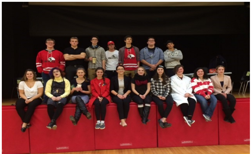
2016 Grad Skit